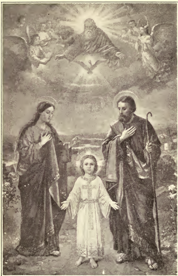
THE HOLY FAMILY.

"He went down with them, and came to Nazareth, and was subject to them."—Luke 2. 51.