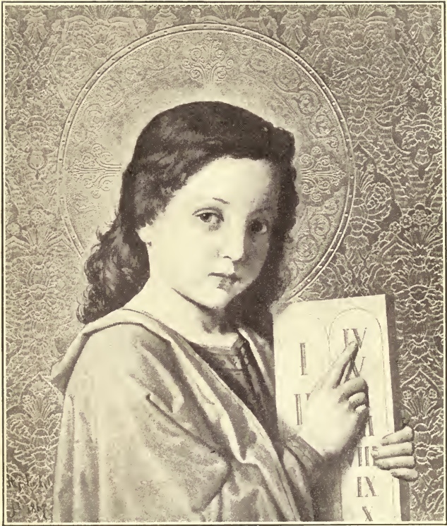
JESUS OF NAZARETH.

"Honour thy father and thy mother, that thou mayest be long-lived upon the land."—Ex. 20. 12.